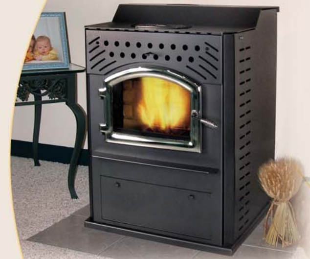
Magnum Winchester cabinet model stove shown with nickel options

Customers comment on our modern cabinet design, our large viewing windows and our graceful, yet sturdy construction. With our Magnum product line, you choose your custom options, including five paint options, nickel and 24 Karat gold plating and three etched glass options. When it comes to buying a biomass appliance, there's only one choice: Magnum. It's the brand you can trust. We guarantee it.