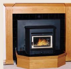
Magnum Countryside fireplace insert (left) and leg model stove shown with gold options, forest green color (below)

This was certainly true in colonial America where open fires were used to warm homes. To rectify this unsafe method of heating, Benjamin Franklin invented the iron furnace stove. Beginning in 1973, Mike Haefner began developing high-end hearth appliances and invented the world's first certified biomass fuel stove, improving on Franklin's heating icon. Using corn and other renewable resources as a heat source is the ecological and economic choice of thousands of homeowners just like you.