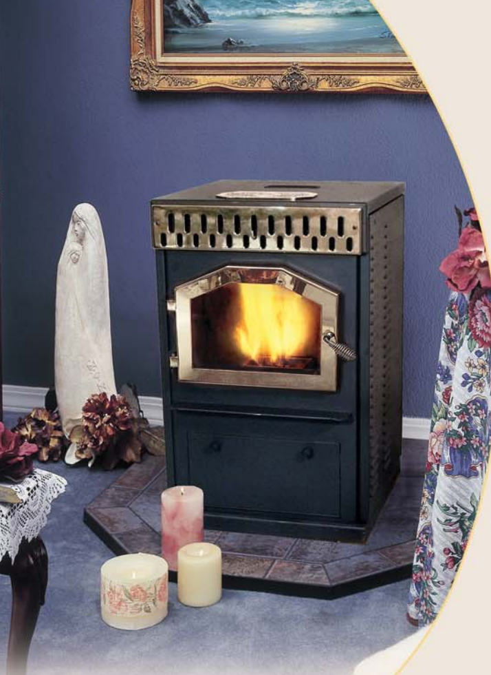
Magnum Baby Countryside cabinet model stove shown with nickel options

When it comes to heating with renewable fuels, think... MAGNUM